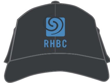
front (shown in blue)